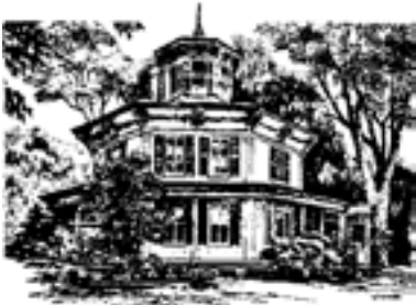
The Historic Octagon House Museum Hudson, Wisconsin

St. Croix County Historical Society The Octagon House 1004 Third Street Hudson, WI 54016