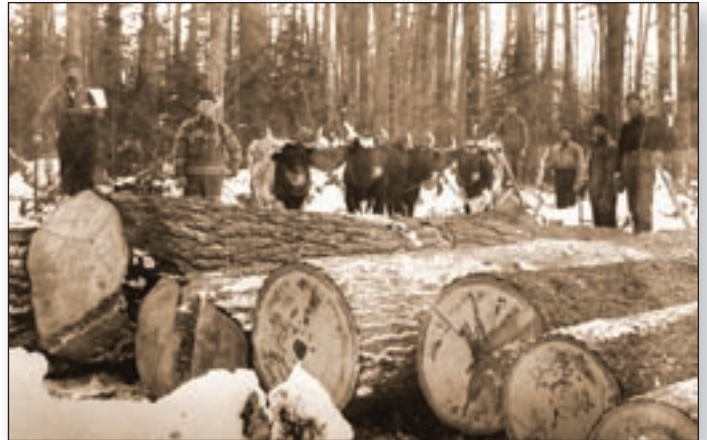
The Ojibway and Dakota Treaties of 1837 opened the St. Croix Valley and its abundant pine forest to the lumber industry.